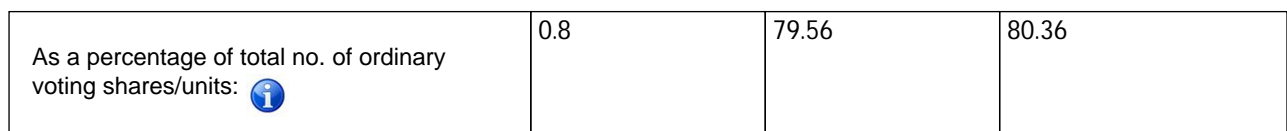
Table 3. Change in respect of rights/options/warrants over shares/units of Listed Issuer